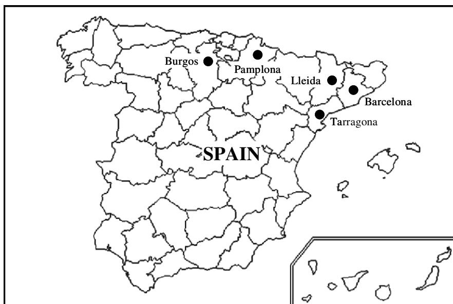
Fig. 1. Map of Spain showing the locations of sewage sludge sampling sites.